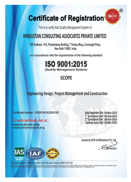
ISO 9001:2015 (Quality Management System)

Hindustan Consulting Associates Pvt. Ltd (HCA) has been awarded with internationally recognised Integrated Management Systems (IMS) Certificates